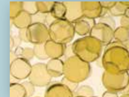
Cation Resin prior to Chlorine increase