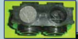
Boyett Family Resin Screen

The invention that may save you several thousand dollars!